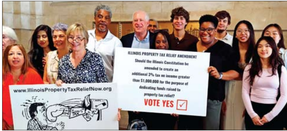
Cook County property owners paid more in median property taxes in 2022 than the typical homeowner living in California's Orange County, Los Angeles County or San Diego County.

Illinois has the second highest property taxes in the nation and Illinois taxpayers